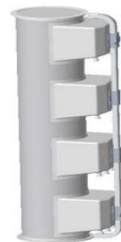
Schematic diagram of antenna