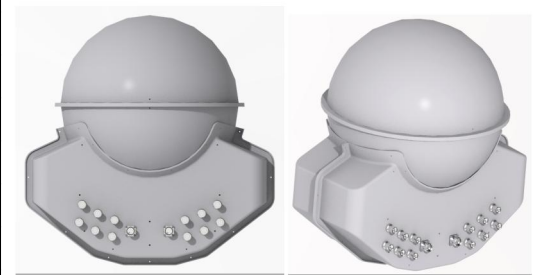
Schematic diagram of antenna